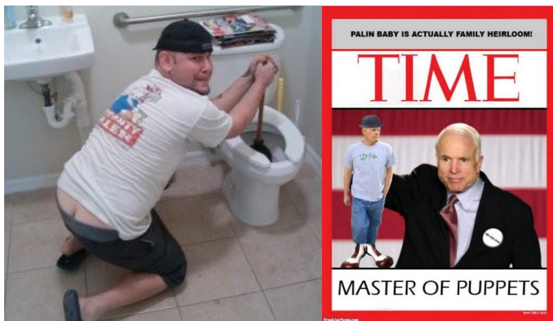
Image 6: Examples of burlesque images of Joe the Plumbers made by McCain Opponents

These ups and downs were much less and weaker about Mirza Agha. In the 12 th presidential election race, Hassan Rouhani's rivals, especially Mohammad Bagher Ghalibaf, tried to portray the image that Hassan Rouhani is not only the ordinary people and the majority of society's representative, but also represents the