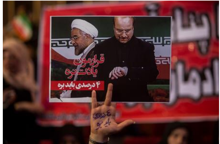
Image 8: One of Ghalibaf's posters in the 2017 election in the background of a photo ads (ISNA, 1396, {2}). In this poster, Hassan Rouhani is going and Qalibaf is looking at his watch. The text is: do not forget our promise: the 4% must go