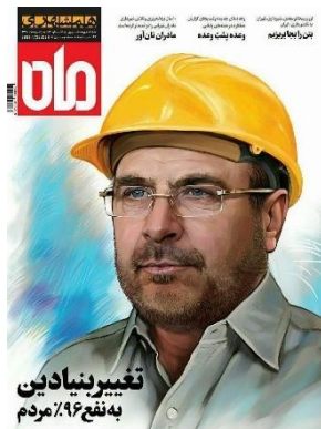
Image 9: publicities in the official newspaper of the municipality of Tehran "Hamshahri" in favor of the Mayor's function (24onlinenews). The text is: A fundamental change in favor of 96% of the population