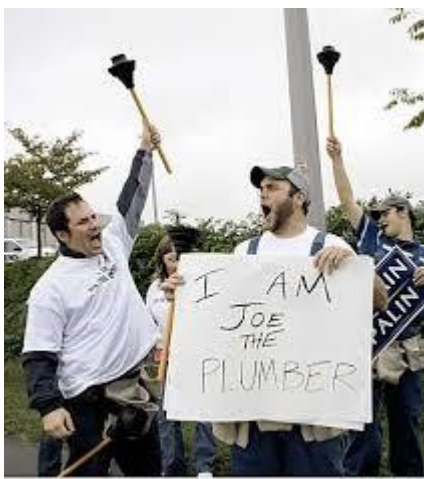
Image 5: McCain fans who are dressed like Joe the Plumber (SFGATE, 2008)

Therefore, the image of Joe the Plumber as a symbol had different meanings during an electoral campaign, which in creating those meanings some elements such as the cultural context of the society, the public media capacities, the opportunism and intelligence of the publicity management teams of the candidates, and of course, Joe the Plumber's cultural luck and his desire to act were involved. Wazelbacher regularly attended conservative political gatherings all over the country, and standing up against taxes and against trade unions, and in favor of conservative family values. At the same time, the groups who were against these policies were engaging in mobilizing anti Wazelbacher scenarios and frequently found plumbers as the "real plumbers" and make them to speak against Joe Wazelbacher in order to mock him and the groups who invited him to attend their gatherings, and to discredit and mock them.