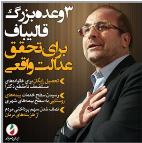
Image 7: One of Ghalibaf's posters in 2017 election. This poster featured three great Qalibaf slogans: free education for the poor to Ph.D., Increasing the level of rural insurance to the level of urban insurance, and reducing people's fees for healthcare costs to 50%

interests of a corrupt, rentier, and interest-seeking minority. Ghalibaf repeatedly used the term 4% for Rouhani in the televised debates and other public space and characterized himself as a representative of the other 96% of ordinary people who have been dominated and exploited that 4% (Rokna, 1396). He later on tried to feature himself as Ahmadinejad –who portrayed himself as a modest man which is a desirable norm between the mass- by presence among workers and the middle and lower classes of the society under the slogan "people's government", in order to depict himself as the public goodness and blessing and introduce Rouhani and his government as the representative of the public evil.