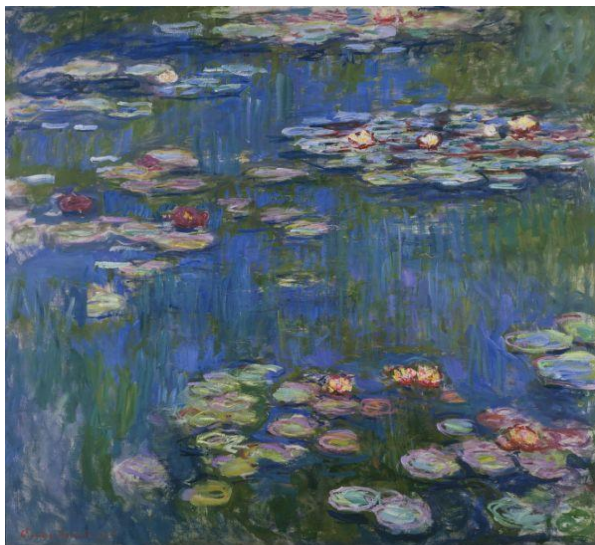
Figure 2: Claude Mont, Water Lilies, 1916, Oil paint on canvas, 200.5 cm x 201 cm, Collection No. - P.19590151, (Source: Website The National Museum of Western Art, Independent Administrative Institution National Museum of Art, 2011).

Allah SWT created a multitude of variety of flora and fauna for the benefit of human life in the world. When the process of photosynthesis ceased, green leaves will turn yellow to red to brown and dry and subsequently drop to the ground. In some cases, all the leaves drop leaving only bare twigs, branches and trunk. In places that experience seasonal changes, this occurrence saves the tree from being broken due to the weight of snow that soon follows in winter. The tree did not in fact die it will flourish again with new leaves and flowers in spring. This change in seasons is thus, marked with the changing colours and state of the trees. Again, colours play a vital role in informing the changing of the seasons. Similarly, designers too select and apply colours in the process of creation. Fashion and textile designers search for information, process and analysed it to produce creative products. Hence, a pattern is created that resembles colours and visual integration with effects of leaves and grass on a military camouflage uniform. It functions to conceal the wearer from the view of enemies in the forest or jungle.