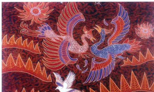
Figure 3: Hashim Hassan, 1987, ‘Intruder’, Acrylic, 143x143cm.

The sight of man is not limited only to the eyes. It is also complemented by the other senses such as touch, smell and taste. For example, the growth of a plant can be seen from the start on its seed that grows shoots and leaves. These develop into a trunk, branches, flowers and fruits. Altogether, the experiences of touch, smell and taste further enrich the experience of sight.