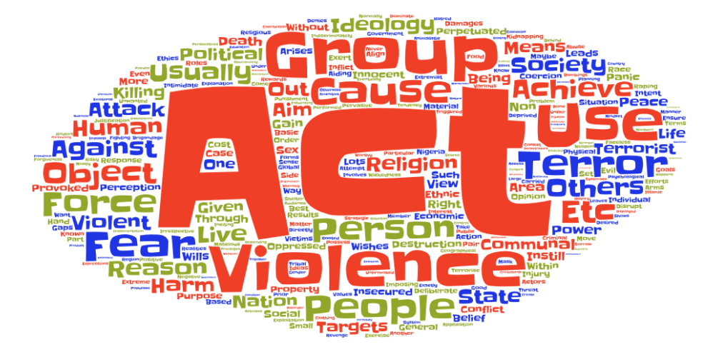
Image 3: Word Cloud showing Academics' conceptualisation of terrorism

The word cloud above reveals that media practitioners interpret the act of terrorism as political, violent, intimidation and an act against peace. Chiluwa (2016) an author in the area of terrorism and media discourse also emphasised the major aim of terrorists, which is to intentionally intimidate people by causing physical harm and threats to change the existing political system. Other dominant interpretation of terrorism identified in the study describes terrorists as a group, destructive and working against societal peace. As the media is delegated with ensuring peace, it is expected they define terrorist in such manner. Dominant beliefs about terrorism are projected through media as media practitioners. Because of the significant role and influence of the media, the public has the tendency to adopt interpretations as presented by media practitioners. Media practitioners set the agenda for how people should think about the issues surrounding terrorism.