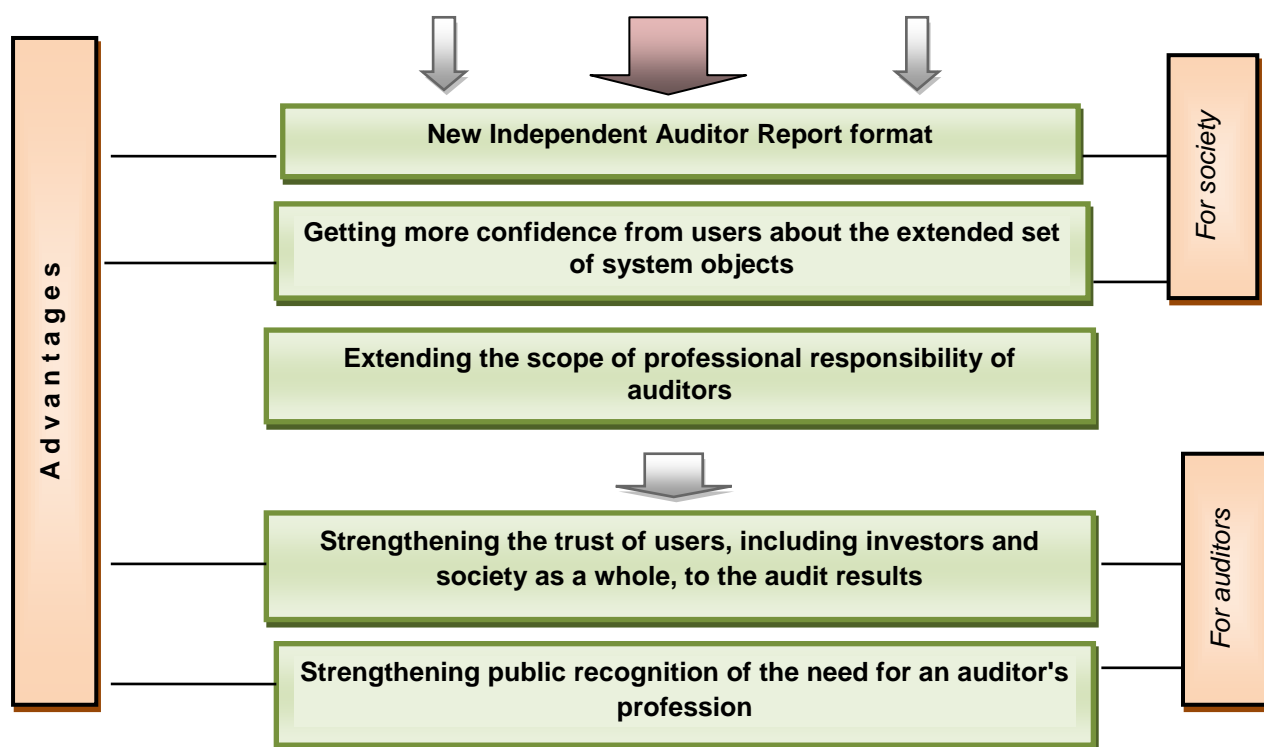
Fig. 1. Formalized presentation of an integrated model of audit of enterprises of public interest