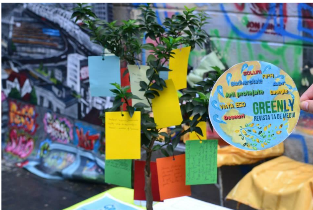
Fig. 3. Greenly's Green Idea Tree

x. At the annual Street Delivery project, Greenly submitted an original project called The Greenly Book for a people's Bucharest that allowed visitors to answer the following question: What is quality inhabitancy? Between June 14th and 16th 2013, visitors were able to write down their ideas and hang them up in Greenly's Green Idea Tree (Fig. 3) – the answers will be featured in Greenly's Book for a people's Bucharest. This book will present the perception of Bucharest inhabitants of their own city.