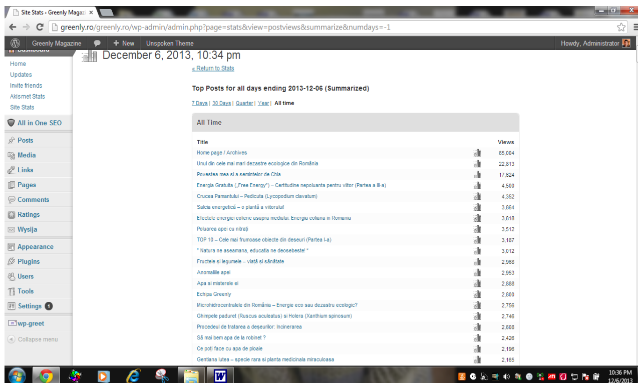
Fig. 2. Greenly’s all-time top 20 most read articles

– Clean Certainty for the Future (part III) ” [5], which holds the third spot on the top 20 list, is part of a 4-piece series on “free energy”, which is highly popular with the magazine’s readers.