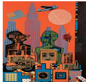
Fig. (2): Eduard Paolozzi, Wittgenstein in New York -silkscreen on paper 763 x 538mm, Tate collection, 1965

The term is an acronym for the word Popular, common sense, or rally. Since the late fifties, pop Art has been associated with business, advertising for goods, photographs, car models, movies and science fictions. The American photographer Eduard Paolozzi (1924 - 2005) Fig. (2) emerged as a representative of that Art, when he used tools at the level of a mass circulation magazines as images with attention to science and technology (6) Art theorists claimed that the quality of such Art should be like a vogue, temporarily, popular, and low cost, and in mass production with repeated thousands of copies. The art became a manifestations of modern life and the means of popular culture. Perishable newspapers, threads, food stuff, and clothing were its ingredients. Pop Art in the United States was a visual re-evaluation of things and events that are living with mankind.