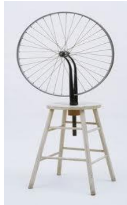
Fig. (1): Marcel de Champ, Metal wheel mounted, (129.5 x 63.5 x 41.9 cm) -New York, 1951