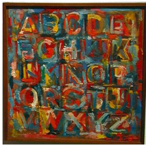
Fig. (5): Jasper Johns, Colored Alphabet, oil encaustic and paper collage on panel, 12 by 10 1/2 inches, 1959