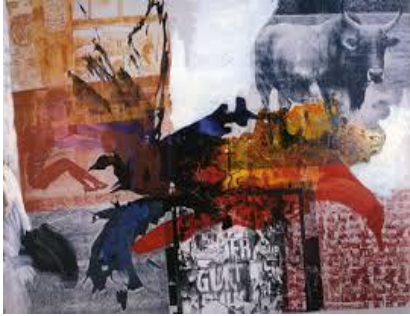
Fig. (3): Robert Rauschenberg, Valley of life / on line memorial blog, Acrylic on canvas, 81x 118cm, 1984