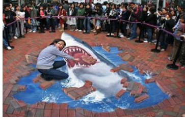
Fig. (8): Julian beaver, Shark in chalk - land Art