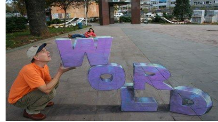
Fig. (9): Land Art setting at a considerable distance from the Artwork