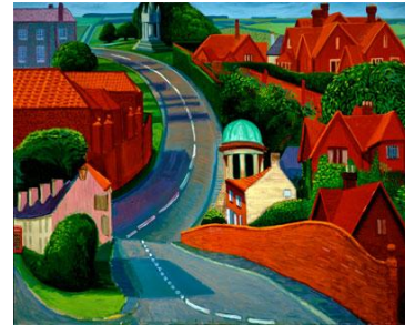
Fig. (6): David Hockney, The Road to York through Sledmere, oil on canvas, 45x60cm, 1997

Pop Artists created a style of their own. It was a reflection of the Tensions and the successive events in a changing world, which is dominated by turmoil and disintegration of human relationships. Pop art style tried to sum up its aesthetic criteria in the following points: