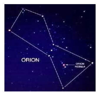
Figure 2. Constellations Orion (Baur Bilah)

Sign of the dry season farmers Banjar ethnic group commonly called by the term sign eastern tip. Observations of the star's position are also done by farmers of Banjar Tribe. Emerging Baur Bilah starts (Orion) also marks the arrival of the dry season. Baur Bilah stars cluster appeared on the western horizon, these star clusters consist of three (in a row) and form a straight line. This constellation, also known as the star constellation plow. This constellation is easily recognizable because there are three twin star in a row forming "Orion's Belt".