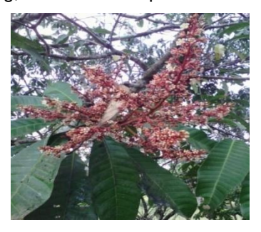
Figure 1. Flower of Hambawang

At our place, if you want to know the arrival of the dry season, just look at the tree of hambawang or kuwini . If the tree is flowering means the coming dry season. If the color of deep red flowers mean the dry season will be long, but if the color pink flowers mean the drought is not too long.