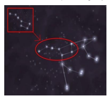
Figure 3. Constellation the Big Dipper (Karantika)

When a star begins to diminish mark karantika upcoming dry season.