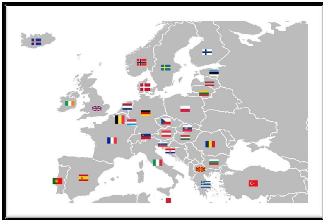
Fig. 2. Map of the States involved in Erasmus+ programme (Evropská komise, 2014)